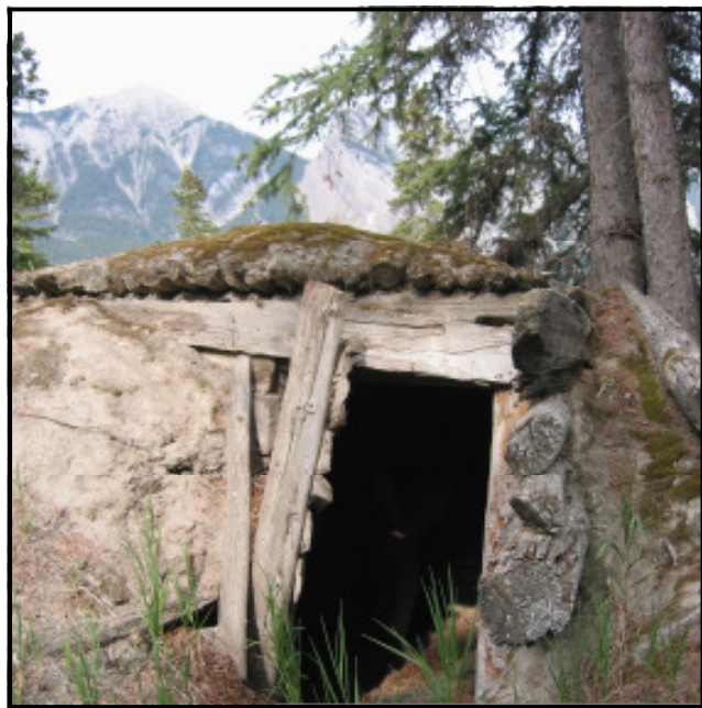
Root cellar located at The Meeting Place

you are driving out in your own vehicle, please park on the road into the old dump/Jack Ladder (10.7 km from the underpass on right side of the highway), just past the Snaring Rd turn off. Walk back from there to the highway sign showing a merge back to a single lane. Someone will be there to direct you to The Meeting Place. Hope to see you there.