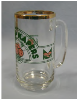
Kobasa Kapers mug 2007.34.01

We recently received a Kobasa Kapers beer mug to add to the collection. Ukrainian Days was a celebration held at the end of the ski season in the early 1970s. It was originally started by locals but was then taken over by the Chamber of Commerce and renamed Kobasa Kapers. The event was very popular and features Krazy Kart